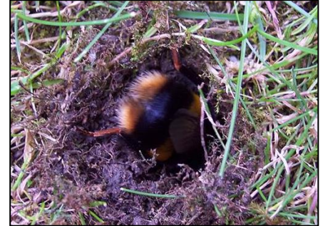
A queen bumblebee preparing for hibernation.

Male bumblebees are born at the end of the summer. Their primary purpose is to mate so as soon as they are grown they leave the nest, never to return. As a result, they spend their nights sleeping on flowers. So, after a few weeks they can look a little weather beaten.