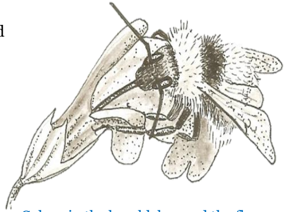
Colour in the bumblebee and the flower

Different bumblebees have different lengths of tongue. This makes them good at drinking from different shaped flowers. The bumblebee on the right has a long tongue.